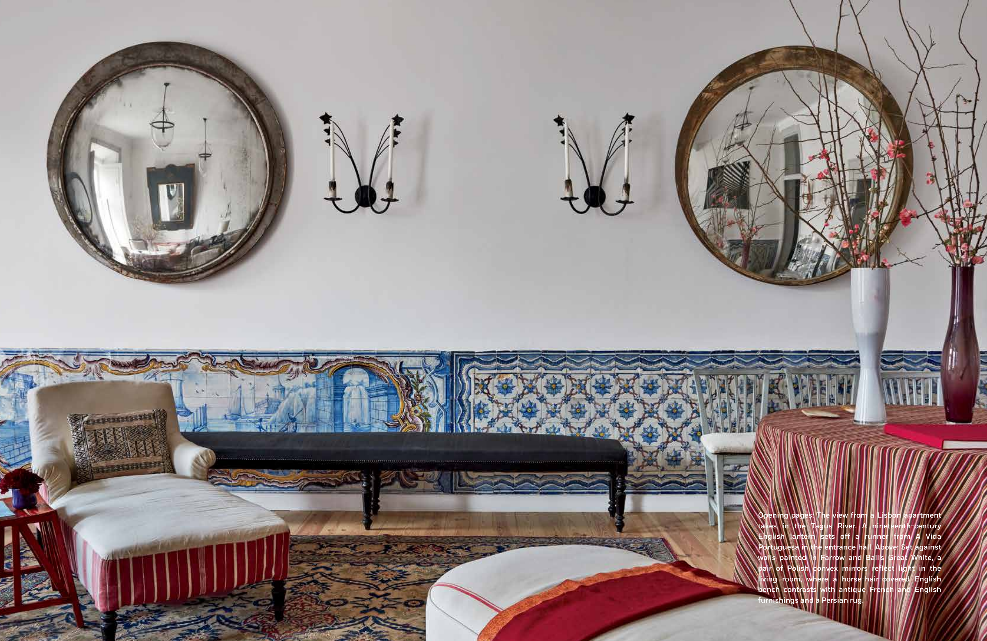
Opening pages: The view from a Lisbon apartment takes in the Tagus River. A nineteenth-century English lantern sets off a runner from A Vida Portuguesa in the entrance hall. Above: Set against walls painted in Farrow and Ball's Great White, a pair of Polish convex mirrors reflect light in the living room, where a horse-hair-covered English bench contrasts with antique French and English furnishings and a Persian rug.