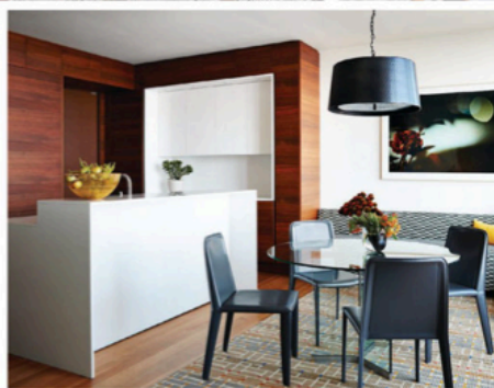
Numerous large-scale windows let light flood into the dining room, living room and kitchen of this 52nd-floor condominium.

Given its prime location on Billionaire's Row, it's fitting that the glow of three of the brightest lights of the New York design firmament would illumine this spectacular apartment at the recently minted 252 East 57th Street condominium building. Developed by World Wide Group and Rose Associates, the 65-story, 95-unit, amenity-rich building—including a 75-foot swimming pool, a spa with steam, sauna, ice and relaxation rooms, a fitness center, screening room, billiards room, lounge, library and more—was designed by a team led by architect Roger Duffy of the New York office of Skidmore, Owings and Merrill. The residential interiors and public spaces were done by AD 100 superstar Daniel Romualdez, who enriched them with luxe materials like marble, white oak and walnut. And this particular dwelling—a 3,000-plus-square-foot, three-bedroom, 3.5-bath