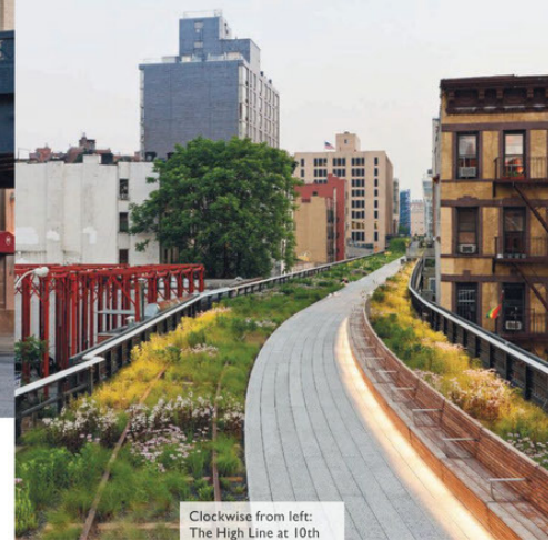
Clockwise from left: The High Line at 10th Avenue Square; the High Line's radial bench; the High Line Nine takes inspiration from its artistic neighbors.