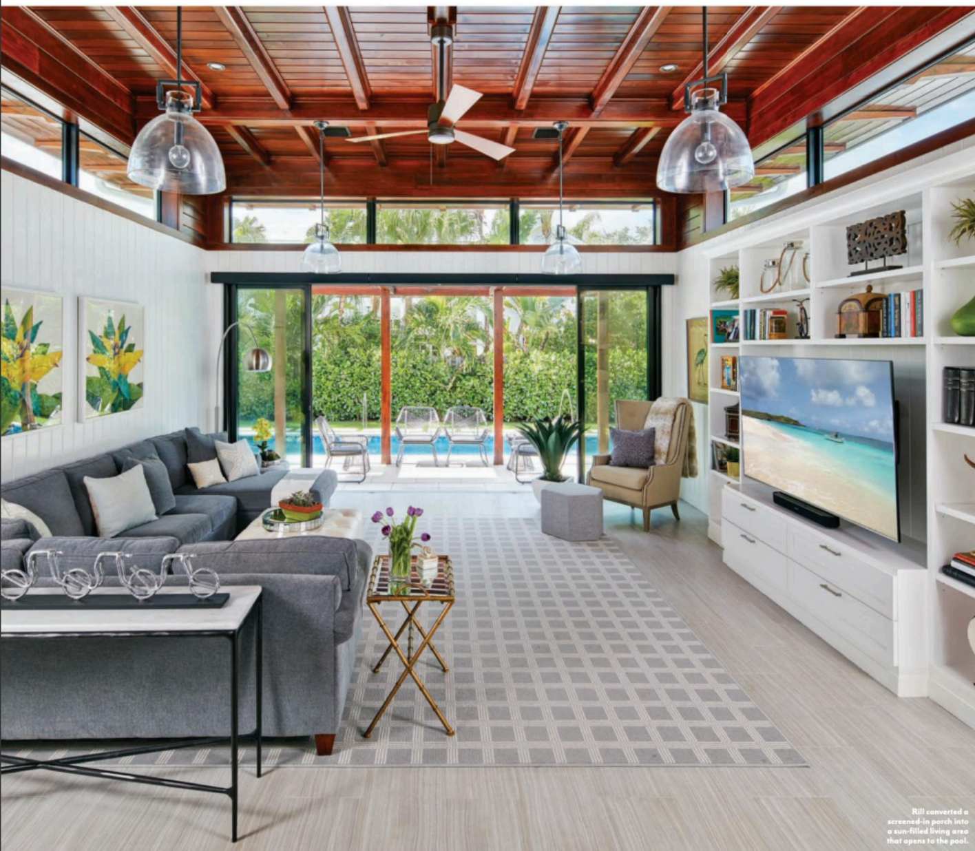
Rill converted a screened-in porch into a sun-filled living area that opens to the pool.