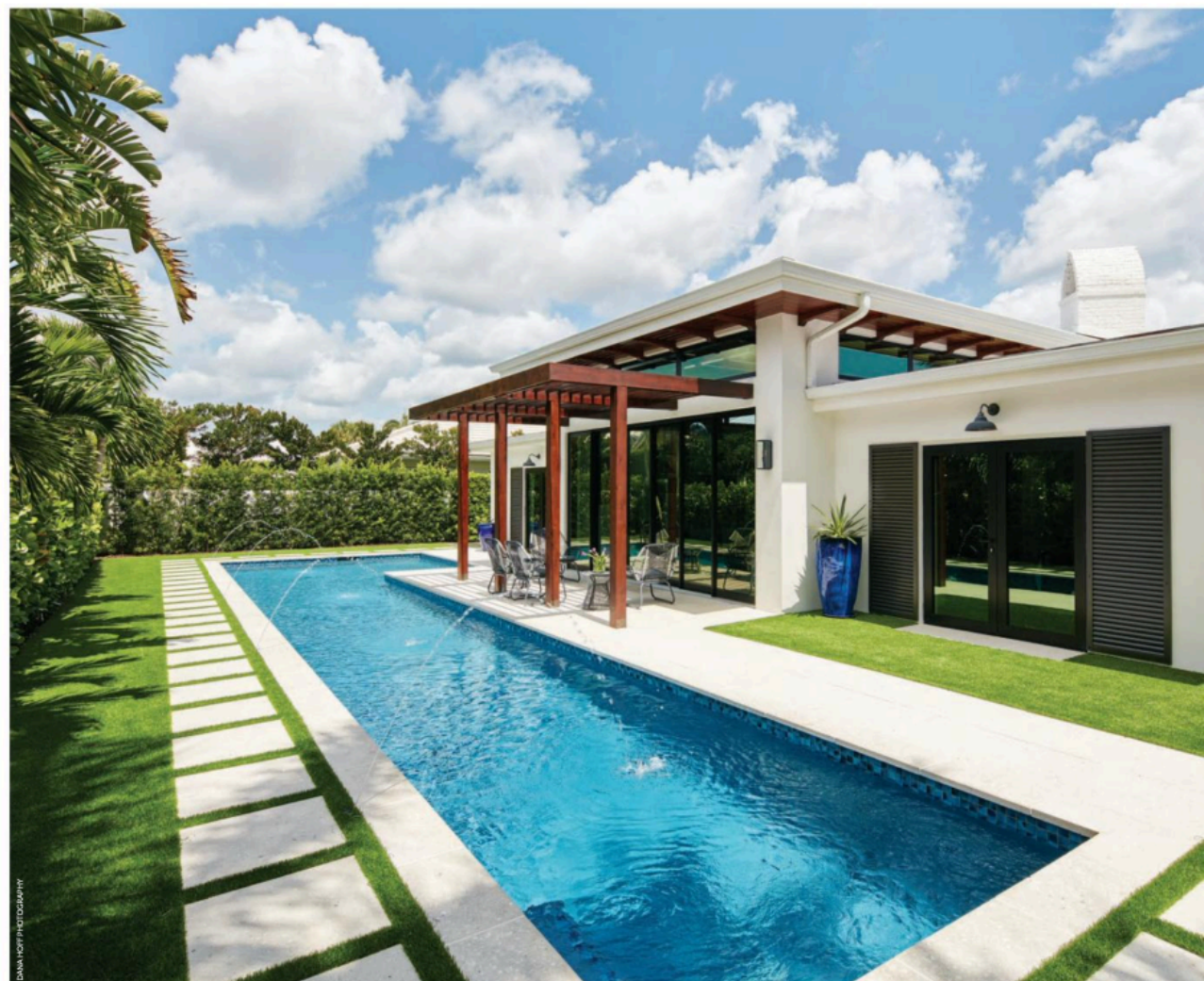
Clockwise from top left: The airy, open kitchen features custom cabinetry, wide-plank wood floors, and pendant lighting; the brand new lap pool, with outdoor patio and pergola; the home's inviting exterior with courtyard, window boxes, and trellis.

Rill also tended to details that add substance and make the home worthy of primary-dwelling status. Among the upgrades that contribute to a newfound sense of elegance: a cedar ceiling in the lofty sunroom; new V-groove paneling in the sunroom and kitchen; and millwork on the tray ceiling of the dining room, where a new table from Restoration Hardware surrounded by slipcovered chairs from Ballard anchor the space with contemporary flair. Working closely with the owners on every aspect of the interiors, Rill helped shape the rooms to reflect their personal style by mixing cherished pieces from their previous home with new furnishings and accents that suit the home's new size. Enhanced light fixtures—such as the pendants from Hudson Goods over the island in the kitchen and the