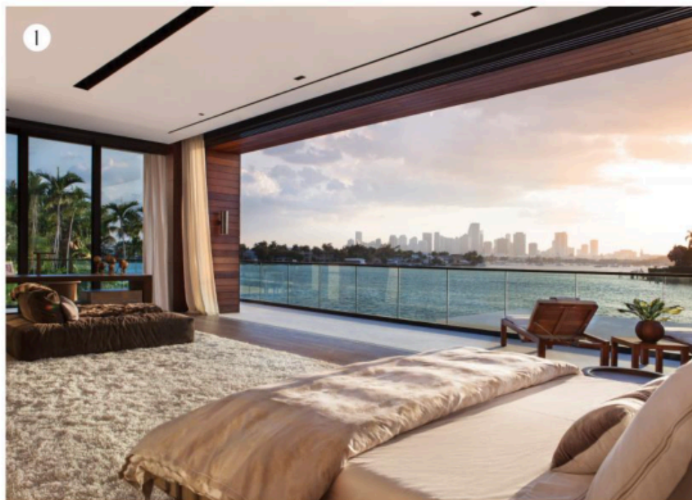
1/ DUNAGAN DIVERIO DESIGN

The master bedroom is the pièce de résistance of a spectacular Venetian Island home overlooking Biscayne Bay. "Situated in its own wing, the voluminous suite is luxurious and elegant with an abundance of soft, supple textures," says designer Charlotte Dunagan. Exotic ipe wood grounds the space, while the modern bed is placed to best appreciate the stunning views, a velvety chocolate-brown chaise offers the perfect spot to lounge, and dark wood doors close for privacy.