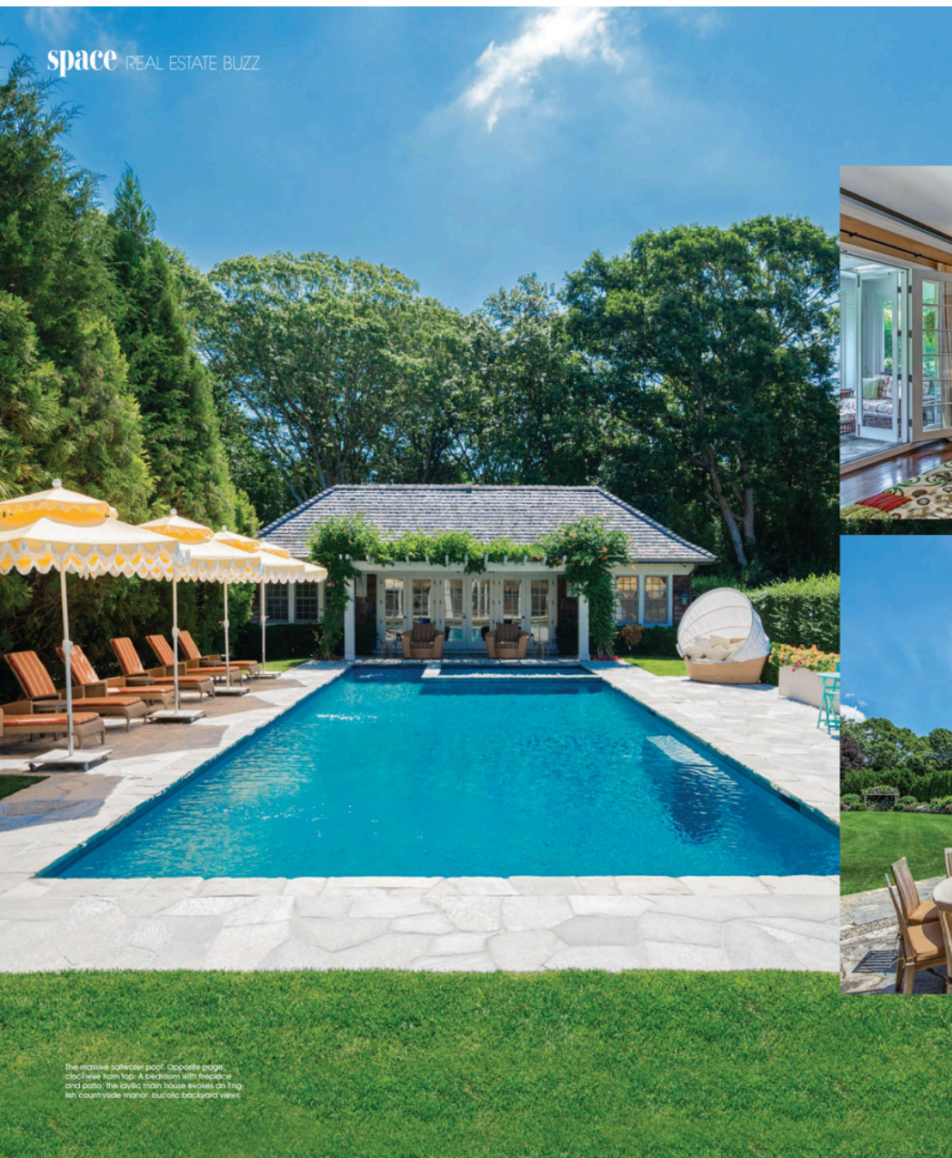
The massive saltwater pool. Opposite page, clockwise from top: A bedroom with fireplace and patio; the idyllic main house evokes an English countryside manor; bucolic backyard views